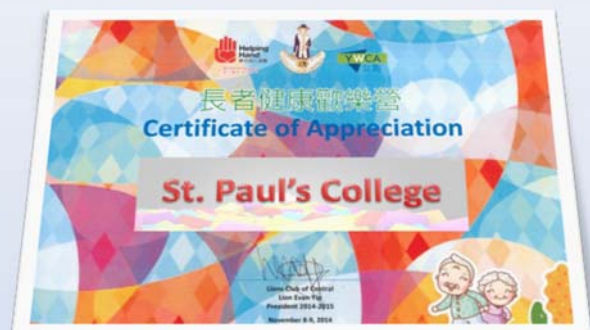
Lions Club of Central – Elderly Camp on 8 th & 9 th November