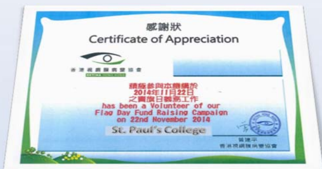
Retina Hong Kong - Flag Selling Day on 22 nd November

Latest OLE News – Please visit the OLE web-